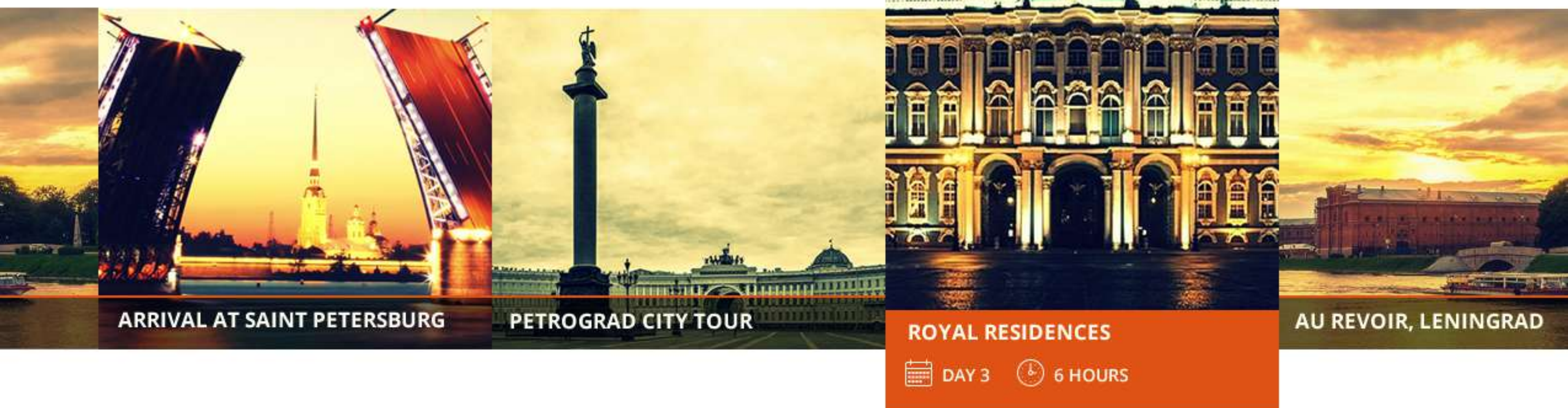
ARRIVAL AT SAINT PETERSBURG