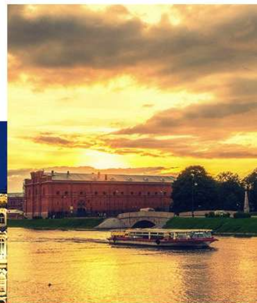
AU REVOIR, LENINGRAD