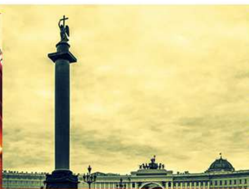
PETROGRAD CITY TOUR