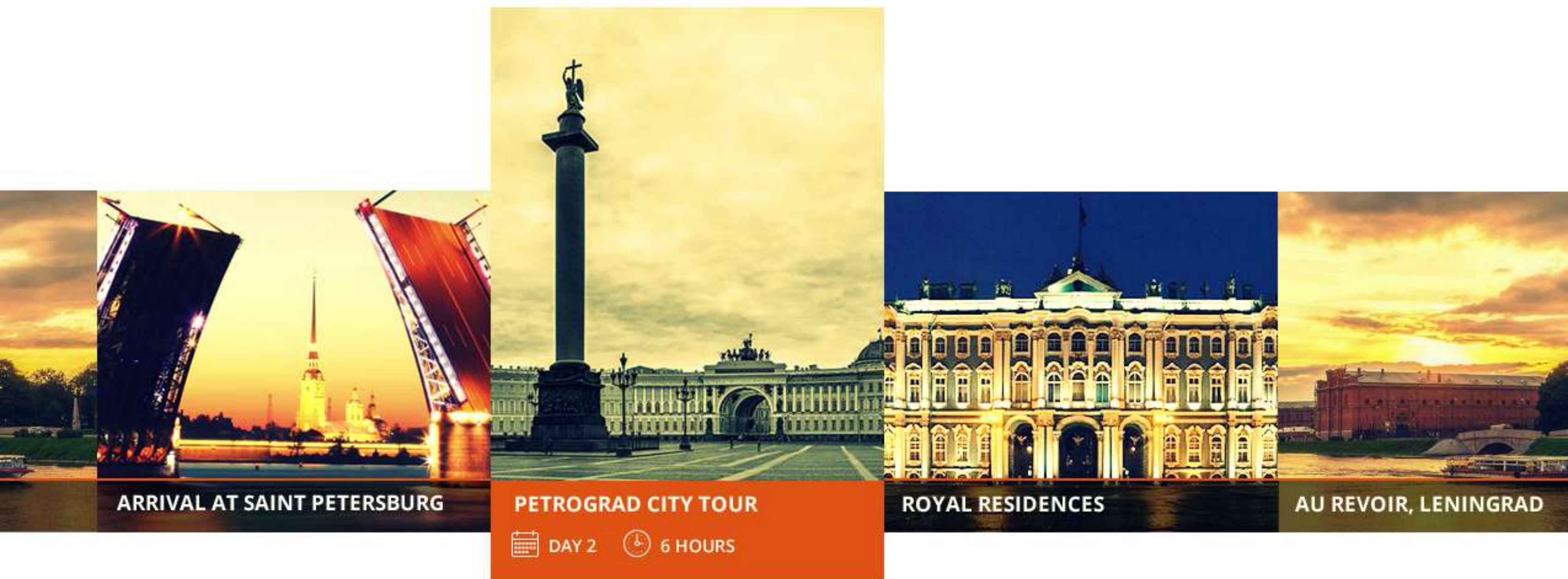
ARRIVAL AT SAINT PETERSBURG