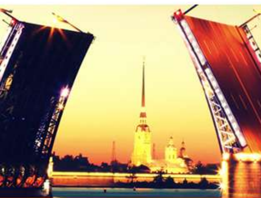
ARRIVAL AT SAINT PETERSBURG