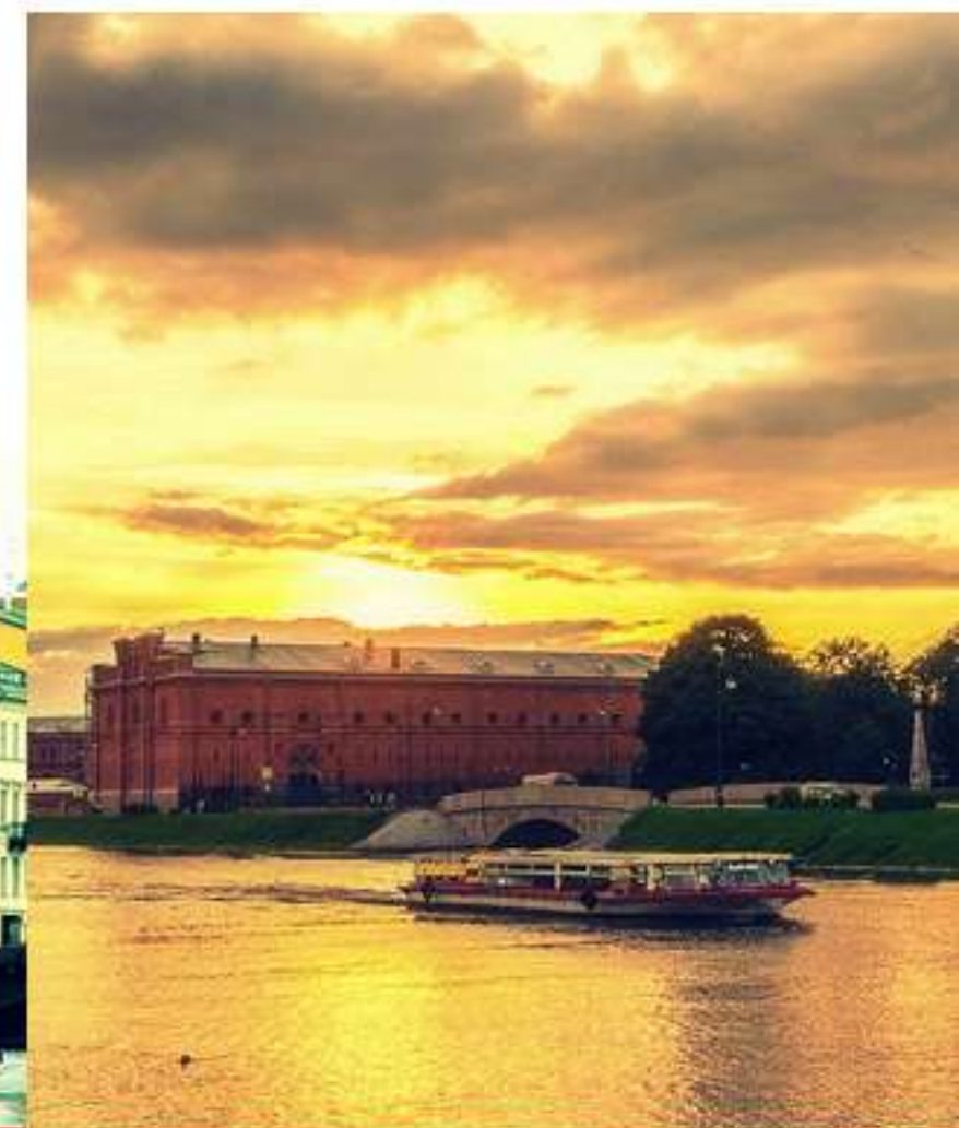
AU REVOIR, LENINGRAD