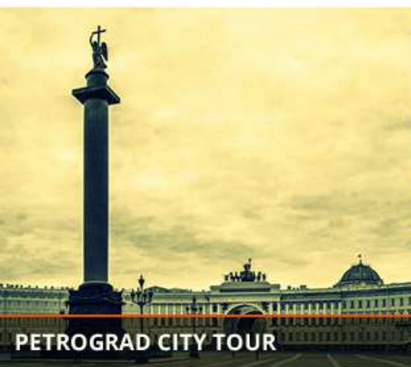
PETROGRAD CITY TOUR