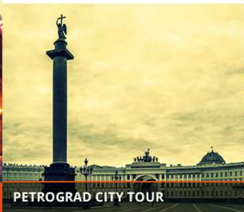
PETROGRAD CITY TOUR