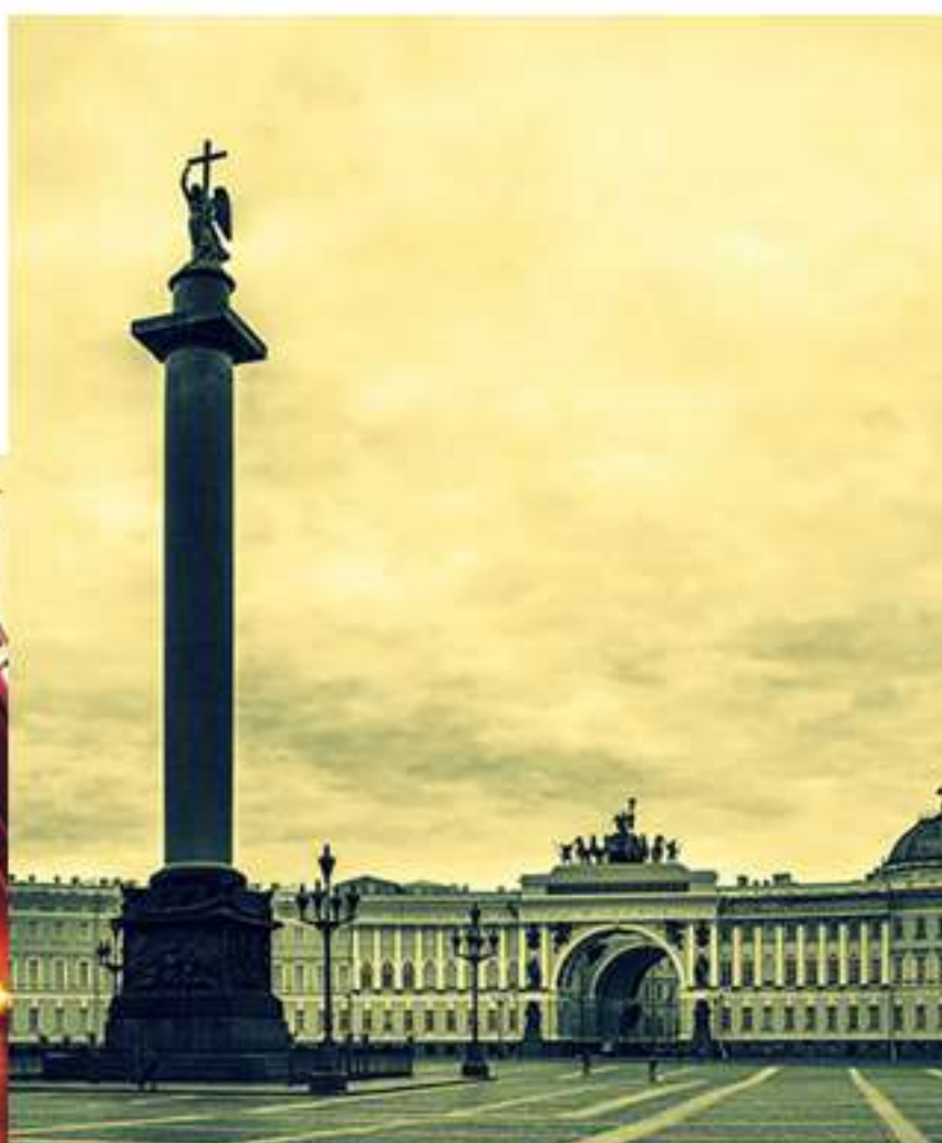
PETROGRAD CITY TOUR