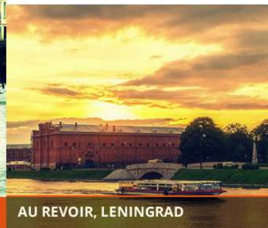
AU REVOIR, LENINGRAD

Location: 30km (19 miles) SW of St. Petersburg.