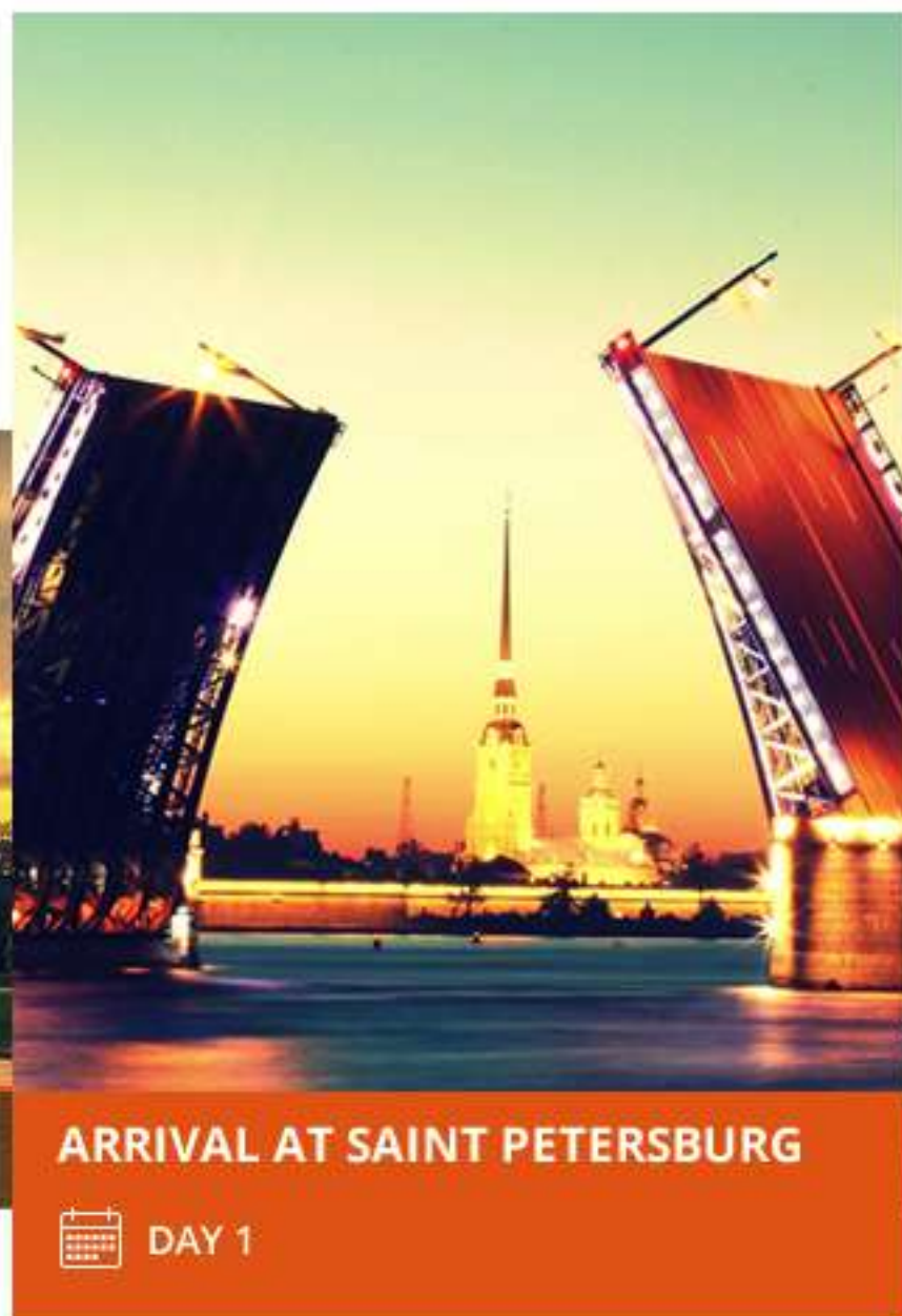
ARRIVAL AT SAINT PETERSBURG